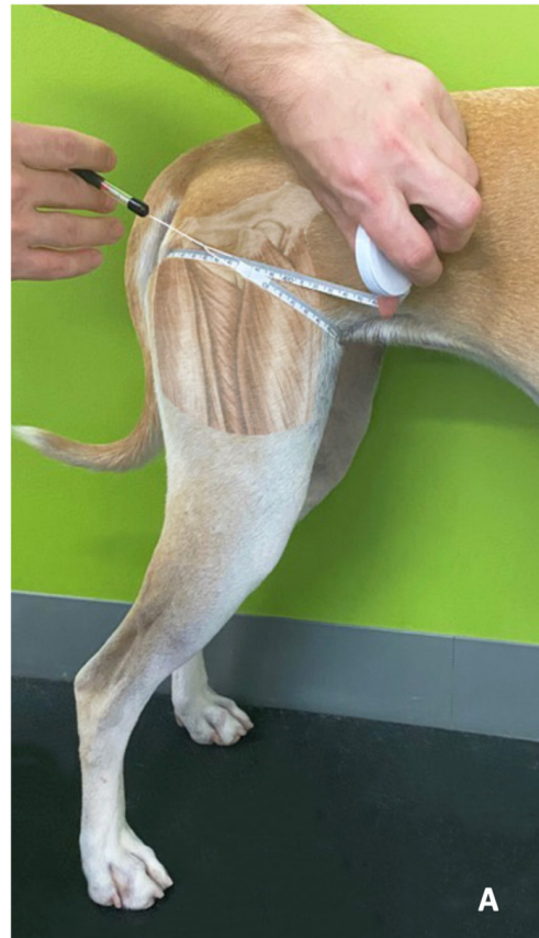
Anatomical image referenced from "Miller's Anatomy of the Dog", 4th Ed.

Supplementary material S1 – Figure S1: Illustrated example of a landmark-girth measurement technique for the canine pelvic limb (PL) (A) using the greater trochanter of the femur and for the canine thoracic limb (TL) using the acromion process of the scapula (B).