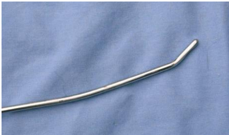
B Figure 1: (A) The Nielson catheter that has been manually adapted to include a 30 degree distal bend at the tip and a 10 degree mid-shaft curve. (B) Shows a close up of the distal tip.