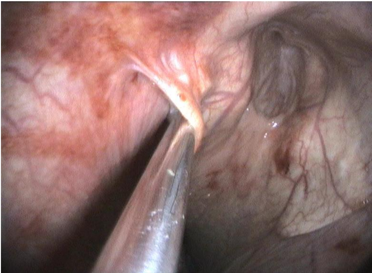
Figure 2: Endoscopic appearance of the pharynx showing the appearance of the Nielson catheter within the horse's right guttural pouch